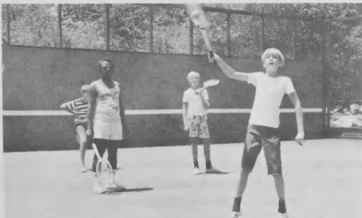
Counselor looks on as youngster practices tennis. Ayudante ta observa com hobencito ta practica tennis.

Ora cu e muchanan bai school bek, sin duda nan lo tin recuendonan agradable di loke nan a haci y sinja durante nan actividadnan di recreo.